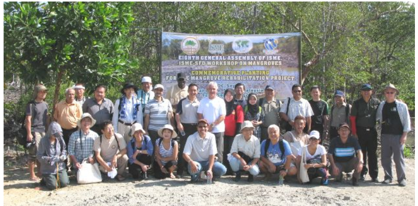
Mangrove and other coastal species were planted at Sg. Lalasun, Sandakan in commemoration of the SFD-ISME Collaborative Mangrove Rehabilitation Project.

In conjunction with the GA, the Executive Committee (EC) met on 12 and 15 September 2011. Among the agenda discussed were: