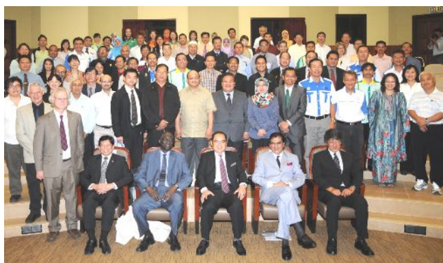
Eight General Assembly of ISME and ISME-SFD workshop on mangroves held at Rainforest Discovery Centre, Sandakan, Sabah.

The Eighth General Assembly (GA) of ISME was held in the Rainforest Discovery Centre, Sandakan, Sabah on 13 September 2011. The Honourable Datuk Peter Pang (Minister of Youth and Sports of Sabah) graced the occasion and presented the Opening Address on behalf of The Right Honourable Datuk Seri Panglima Musa Hj. Aman (Chief Minister of Sabah). Welcoming remarks were delivered by Datuk Sam Mannan (Director of Sabah Forestry Department) and Prof. Salif Diop (President of ISME, 2005-2011). Among the highlights of the GA were the Announcement of the Executive Committee (2011-2014), Activities and Finance, Revision of the Statutes, and Award Ceremony. The GA was attended by participants from Malaysia, Thailand, Australia, France, Japan and India.