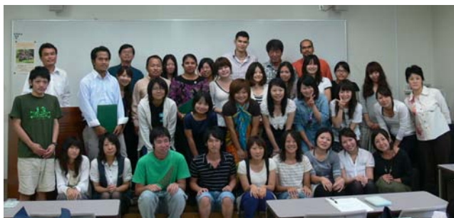
Course participants and university students after the presentation.

action plans and proposals for presentation. Their presentation was made at University of the Ryukyus, and participated by over 30 students, the QA session was held in a lively atmosphere.