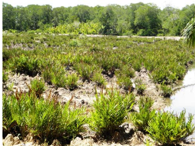
Trial area besides Sungai Lalasun for initial planting of Rhizophora mucronata