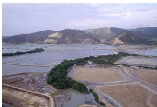
Shrimp pond conversion in Ecuador. Once converted, it is difficult to revert to healthy mangrove forests.

But mangroves are vulnerable. As the Gulf of Mexico oil spill creeps eastwards and southwards towards the extensive mangroves of central and southern Florida the concerns are clear. Near continuous oil spills on a similar scale to the Gulf of Mexico have beset the vast Niger Delta over a period of 50 years, devastating the lives and economies of nearly 20 million people. Mangrove clearance is even more worrisome. Vast tracts of mangroves have been cleared for shrimp aquaculture,