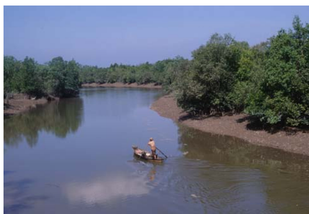
Local coastal people depend on mangrove ecosystems for their living

“Mangrove forests are the ultimate illustration of why humans need nature,” says Dr. Mark Spalding, lead author of the World Mangrove Atlas . In place after place the book details the extraordinary synergies between people and forests. The trees provide hard, rot-resistant timber and make some of the best charcoal in the world. The waters around mangroves foster some of the greatest productivity of fish and shellfish in any coastal waters. What's more, mangrove forests help prevent erosion and mitigate natural hazards from cyclones to tsunamis – these are natural coastal defenses whose importance will only grow as sea level rise becomes a reality around the world.