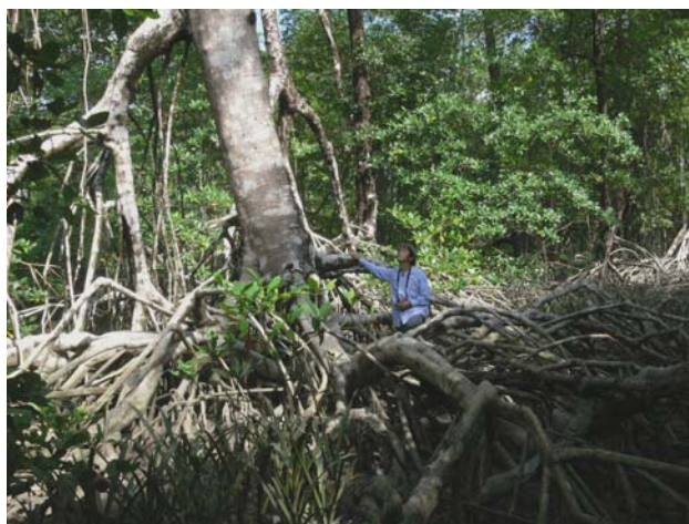
Rhizophora mangle , typical mangroves in North and South America and West Africa which can grow up to 60 m (photo: S. Baba, Brazil)

These forests that straddle land and sea are found in 123 countries in tropical and subtropical regions. Globally they are rare, covering only 150 000 square kilometers. They are disappearing faster than any other forest type on earth*.