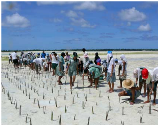
ISME mangrove plantation with school children to form coastal defense in Kiribati